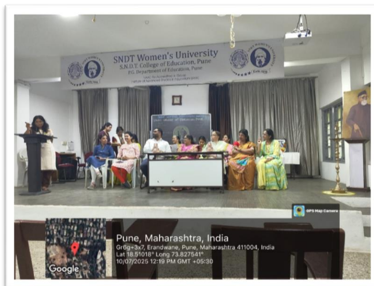
DISTRIBUTION OF SWEETS AND CHOCOLATE AFTER THE QUIZ

The program concluded with a vote of thanks, which was proposed by Samruddhi to honourable teacher for their guidance towards students.